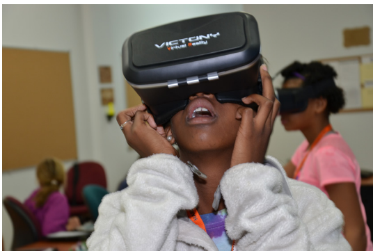
Virtual Reality became reality for our Verizon Girls.

In 2018, Patrick Henry Community College was awarded a grant from the National Association for Community College Entrepreneurship to implement the Verizon Innovative Learning Program for Girls, after a successful pilot launch in 2017. Approximately one hundred girls from Martinsville, Henry and Patrick Counties are participating in the program which began with a three week summer camp held at the Dalton IDEA Center and at the Patrick County PHCC Site for participants in Patrick County. The year-long program encourages middle school girls to get involved in STEM (Science, Technology, Engineering and Math) by teaching them skills in four core areas: Design Thinking, Virtual Reality, 3D Design/Printing and Coding.