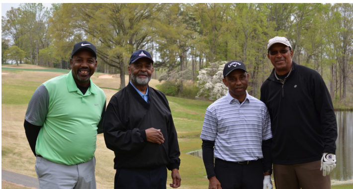
The winning team from A Safe Hands Transportation

The PHCC Foundation, in conjunction with the PHCC Athletic Department, hosted the 7th Annual Foundation Golf Tournament on April 23rd. Proceeds from the event benefited the athletic department's operations for student-athlete welfare.